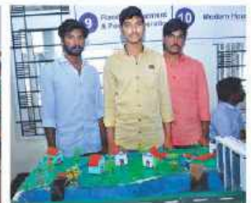
Students demonstrating their projects.