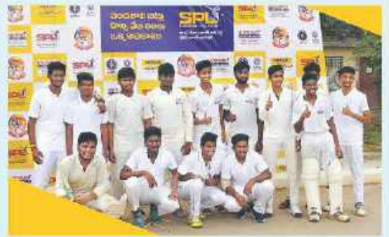
MIC Diploma Cricket Team Sakshi Cricket 2019-20 Runners