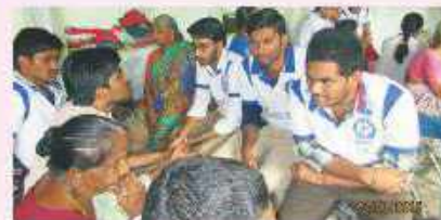
NSS - Visit to Oldage Home