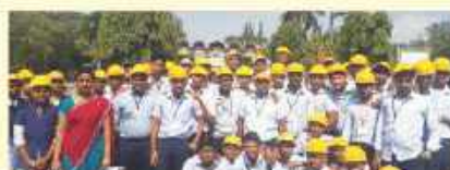
Visit to Electric Loco Shed, Vijayawada

To supplement and enrich classroom learning and encourage new interests amongst students industrial tours are regularly conducted.