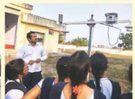
Visit to RADAR